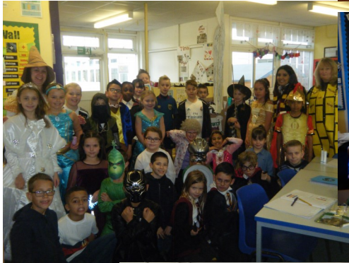
Dressing up on World Book Day