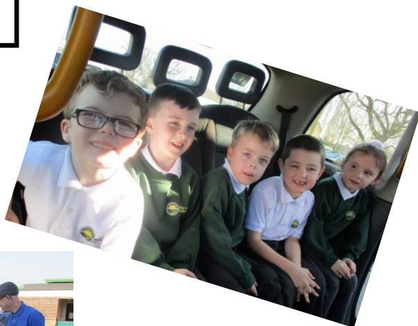
As part of the transport topic, year 1 explored a real taxi.