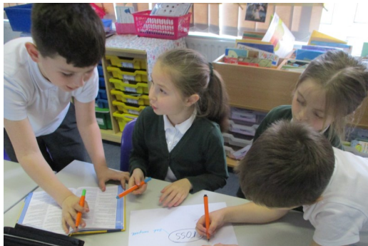
Discovering synonyms using a dictionary and thesaurus