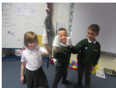
As part of Book Week, Year 2 read the classic book of Peter Pan and re-enacted scenes including Captain Hook!