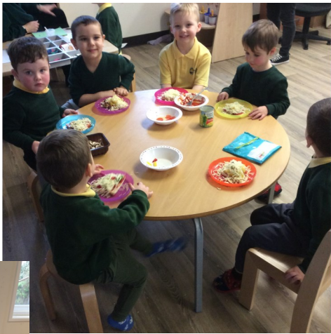
Pizza making in the nursery