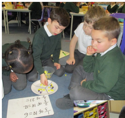
Working in trios to investigate maths problems