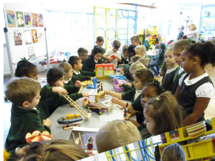
Year 1 compared old and new toys.