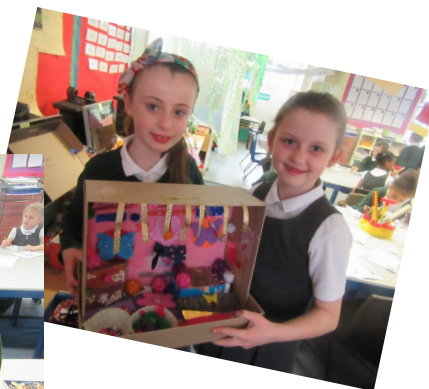
Designing bedrooms as part of the building