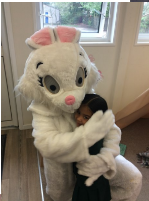
The PTFA Easter party including the Easter Bunny!