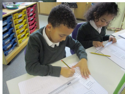
Developing pace to solve mental maths questions