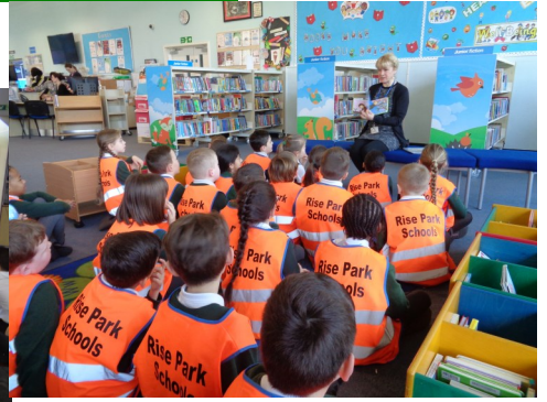
Year 3 visited Romford Library