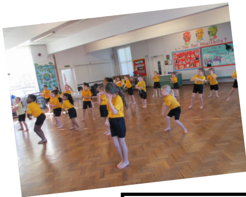
Jam Dance Taster Session and making puppets.