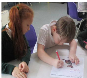
Sharing ideas for a character