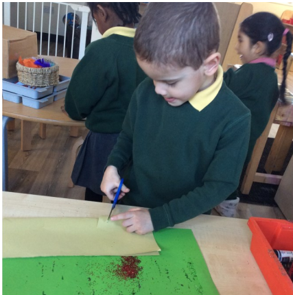
Creating Chinese New Year lanterns