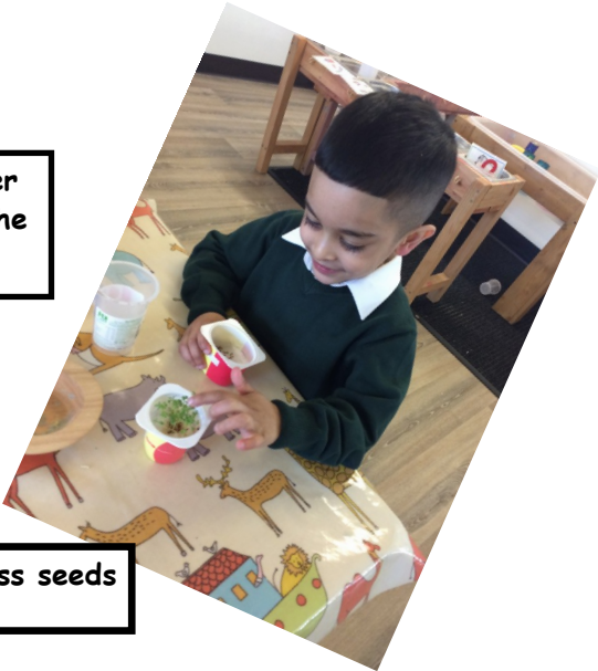
Growing cress seeds