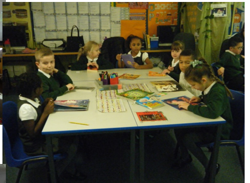
Reading Partners with Infant children